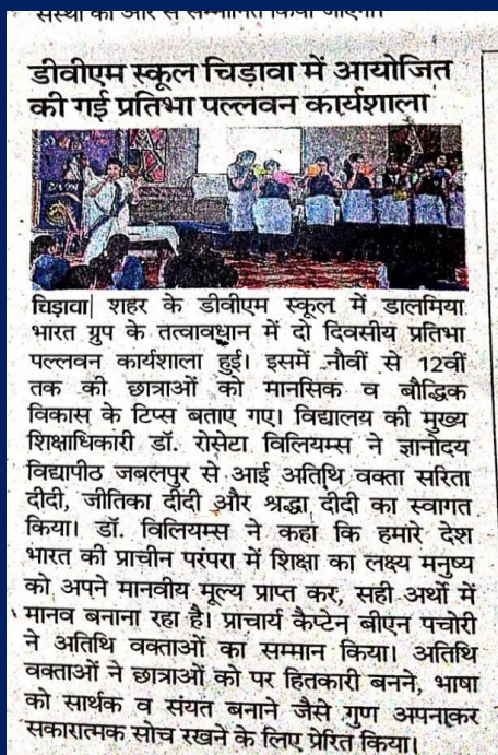
12 April 2024 : Dainik Bhaskar, Pratibha Pallavan Workshop”