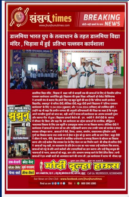
12 April 2024 : Dainik Bhaskar, Pratibha Pallavan Workshop”