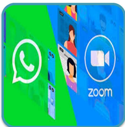
Summary of Zoom/Whatsapp Classes at DVM for Week (23rd to 30th May 2020)